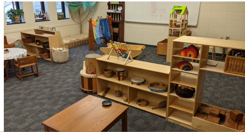
Clockwise from left: Building forts is one of many activities Prairie Flower children enjoy during visits to the woods; center director Monica Marcomb connects with the community during the City of Ames' 2023 EcoFair; natural textures and toys help inspire open-ended play.